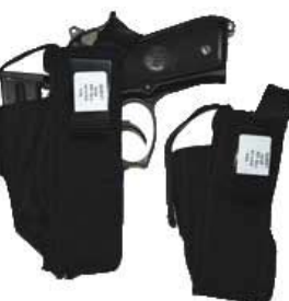
49050BLK SMALL 49054BLK LARGE