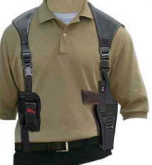
501003NBLK SM 3", 501004NBLK MD 4" 501006NBLK LG 6", 501008NBLK XL 8" DOUBLE HARNESS w/DOUBLE POUCH