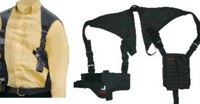
502001BLK Sigma, 52009BLK 9mm, 502091 MD Glock, 502092BLK LG Glock 502090BLK SM Glock, 502094BLK H&K HSH, 502945BLK 9/45 HSH, 502380BLK 380 DOUBLE HARNESS w/DOUBLE POUCH