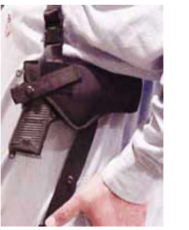
50201BLKM - Laser (SINGLE & DOUBLE) 502025BLK - 25 SINGLE HARNESS