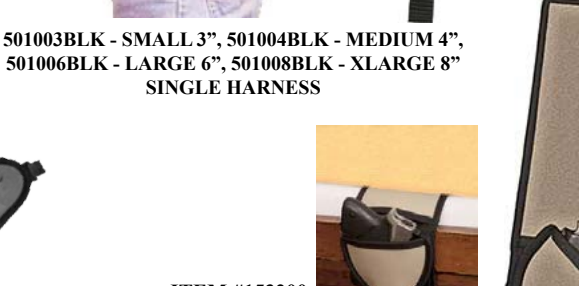
ITEM #153200 BED/COUCH HOLSTER Fits Revolvers & Autos